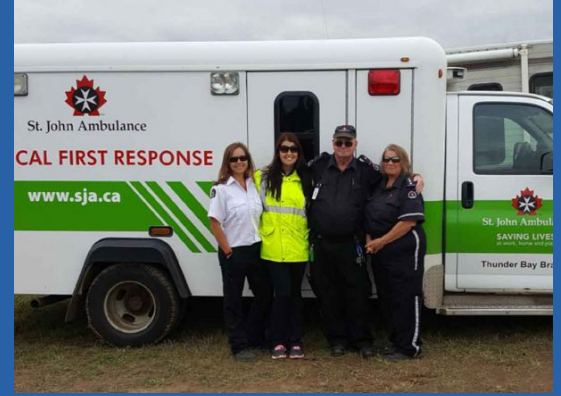
St. John Ambulance Staff

The $13,000 fund was made possible by donations from Thunder Bay Broom and Chemical Ltd., Uride Thunder Bay, the Toronto Community Foundation, Happy Time Tours and Travel, as well as many individual donations.